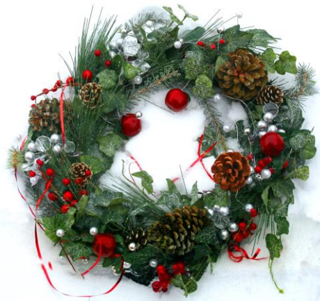
Decorated Wreath With or without LED