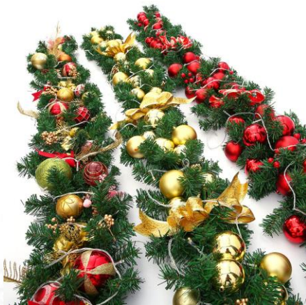
Decorated Garlands With or without LED

These are complementary products that Prince proposes with the Christmas trees. All decorations are according to the colour theme chosen and may differ.