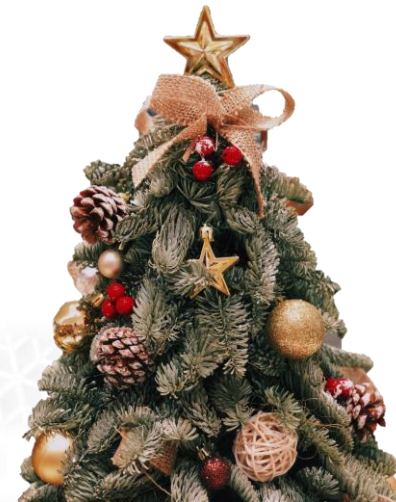
Custom-made Mini Live Trees With LED 30cm, 40cm and 50cm