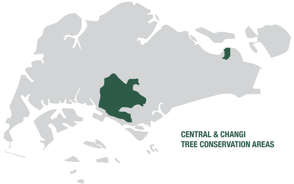
CENTRAL & CHANGI TREE CONSERVATION AREAS

Under the Parks and Trees Act of Singapore, healthy trees with girths of more than one metre are protected as long as they provide lush greenery and improve the ambience of the TCAs (Tree Conservation Areas). If a tree owner proceeds to fell or remove a protected tree without attaining approval from NParks, the owner is liable to pay a fine not exceeding $50,000.