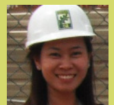
Serene SG - 0352A

Prince's Landscape & Construction Pte Ltd A 53 Sungei Tengah Road Singapore 698998 T +(65) 6763 7000 | F +(65) 6892 2700 | E plant@prince.com.sg